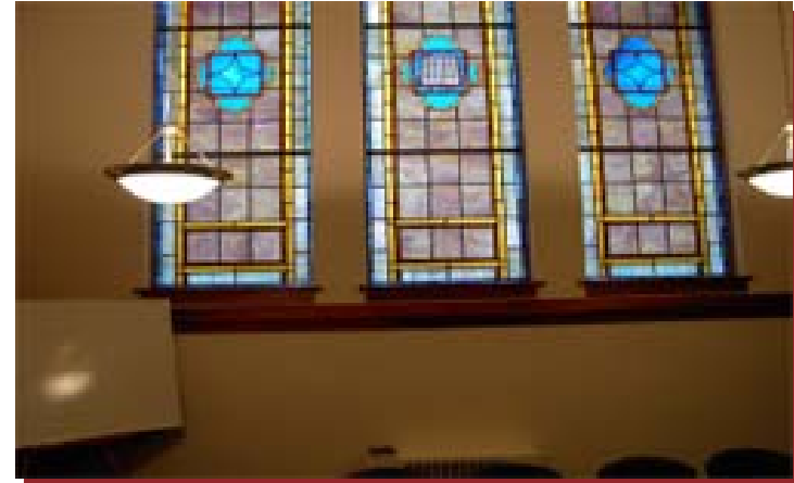
View looking at the stained glass windows in the Library. The windows were virtually hidden before this renovation.