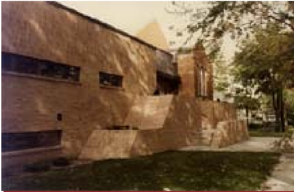
NEW PHOTO MAIN ENTRANCE AFTER RENOVATION