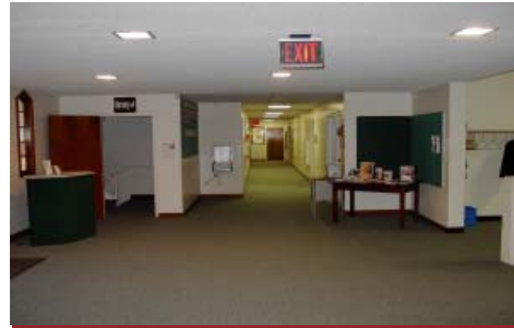
View looking West down the main corridor of the Education wing and new Office area.