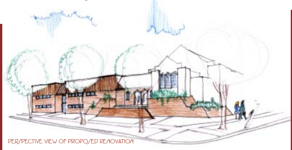
PERSPECTIVE VIEW OF PROPOSED RENOVATION

The two story structure is constructed with barrier free ramps from the first floor to the second floor to permit easy access. The main entrance to the church and the educational building was designed to join the two structures as if they were originally designed to fit together. The first floor includes five class rooms, one storage room, a large class room area, a gymnasium, a kitchen and restroom facilities. The second floor contains eleven classrooms, a library, the existing sanctuary, expanded narathex, and new entrances.