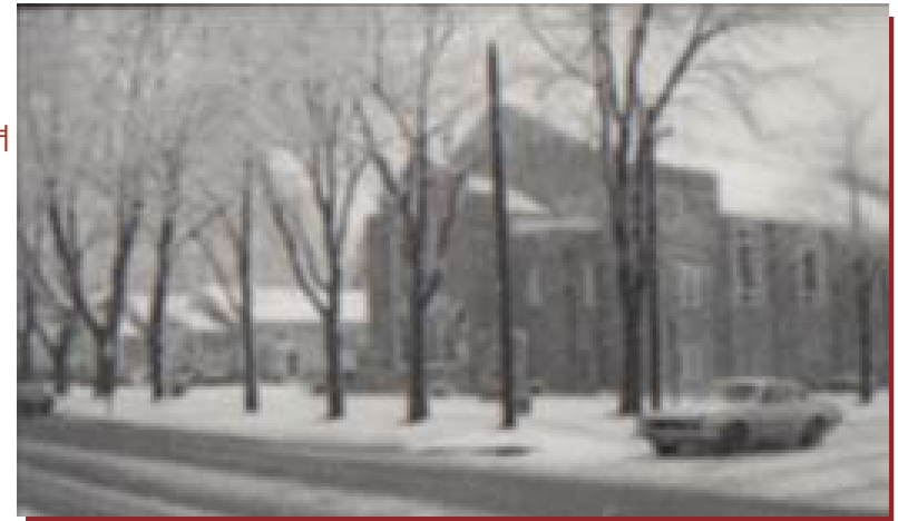
EXISTING PHOTO MAIN ENTRANCE BEFORE RENOVATION

TYPE OF PROJECT: ADDITION RENOVATION CONSTRUCTION COST: $520,000.00 SQUARE FEET: 16,000 NUMBER FLOORS: 2 PROJECT COMPLETION: June 1979 CONTRACTOR: Coles & Schuppe Construction