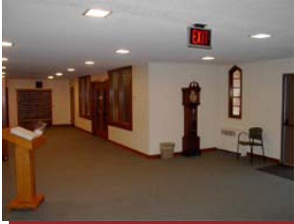
View looking into the expanded Narathex.

EDUCATIONAL & GYMNASIUM ADDITION W/ BARRIER FREE ENTRANCE 1050 West Southern Ave., Muskegon, MI 49444