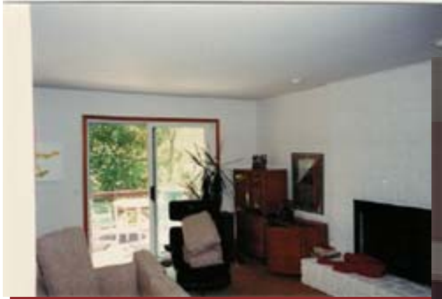
Existing view looking out onto the deck from family room.