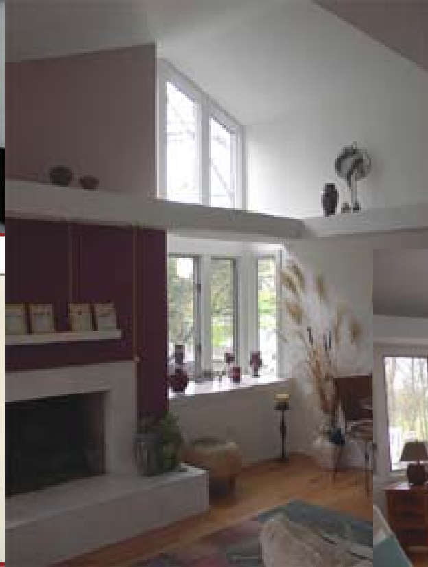
After remodeling with cathedral ceiling, light tray new window treatments.