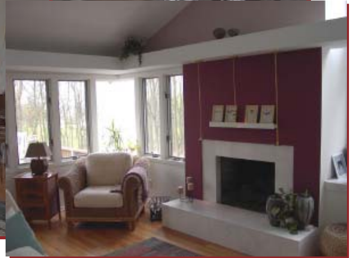
View looking out at the new corner window area to the southeast.