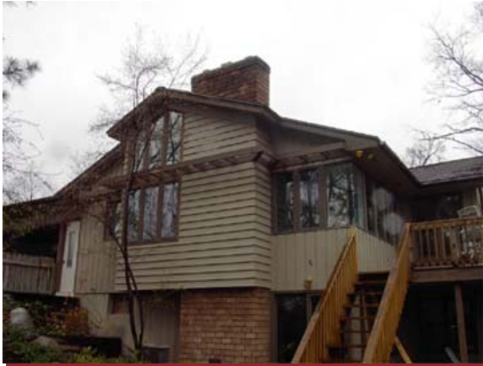
NEW PHOTO SHOWING CLEAR STORY & CORNER WINDOW AFTER RENOVATION