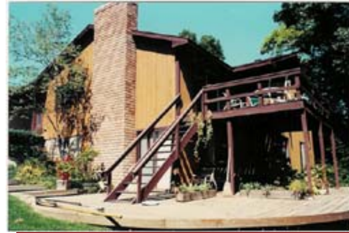
BEFORE PHOTO SOUTHEAST CORNER BEFORE RENOVATION

TYPE OF PROJECT: ADDITION/REMOVAL CONSTRUCTION COST: $45,000.00 SQUARE FEET: 400 NUMBER FLOORS: 1 PROJECT COMPLETION: September 1991 CONTRACTOR: DOM FERRY