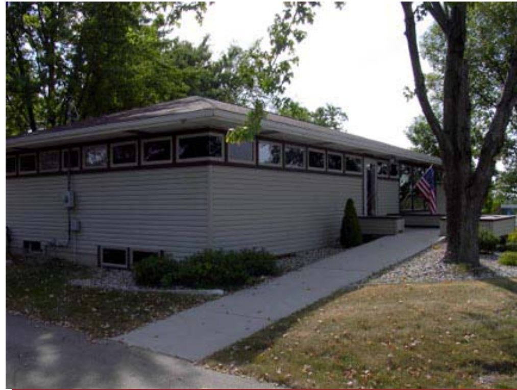
NEW PHOTO MAIN ENTRANCE. AFTER RENOVATION

TYPE OF PROJECT: RENOVATION CONSTRUCTION COST: $120,000.00 SQUARE FEET: 3,500 NUMBER FLOOR: 2 PROJECT COMPLETION: December 1999 CONTRACTOR: Vermurlen Architecture