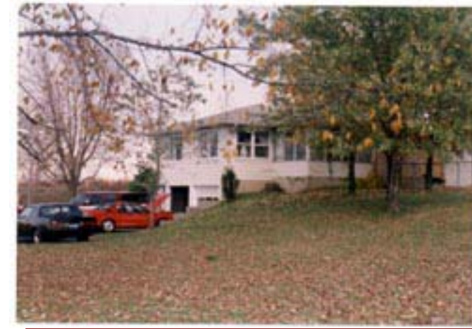
EXISTING PHOTO WEST LOWER ENTRANCE BEFORE RENOVATION