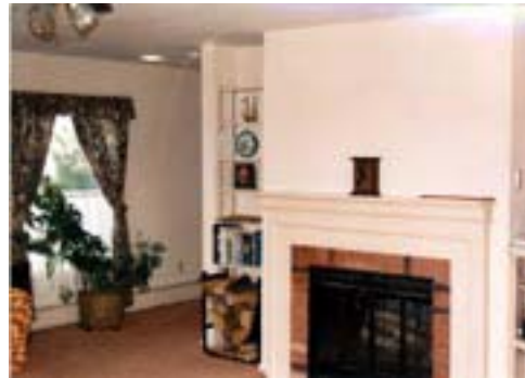
View looking at the before general office area