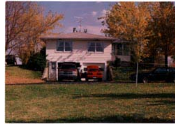
EXISTING PHOTO SOUTHWEST CORNER BEFORE RENOVATION

The two-story structure was an existing single-family residence. Rezoning the property took approximately one year. The project proceeded after the main re-construction of 60th St., which was completed in 1997. The project was divided into five segments; first replace the exterior windows and siding to give the building a more commercial look. The second project was to complete the parking and commercial entrance to the property. The third was to demolish the interior spaces, the structure has clear span trusses so all interior walls could be removed. The fourth project finish the interior space. The final project was to install the barrier free ramp and landscape the entrance. The result is a fifty percent increase in office space with five times the library and a carpentry workshop for model making.