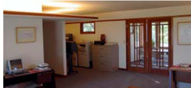
View looking at the after general office area remodeled same view.