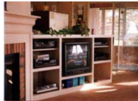
View looking at the before the general office.