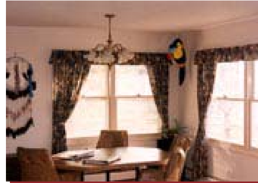
View looking at before renovation southwest corner.