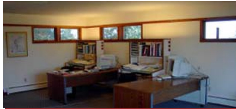
View looking at two of the five workstations looking at the southwest corner.

NEW OFFICE REMODEL EXISTING BUILDING 5090 60th St., S.E., Grand Rapids, MI 49512