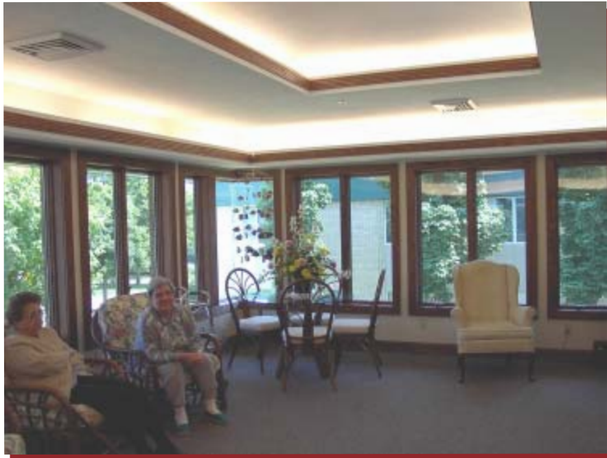
View looking out the new front porch.

HOME FOR THE AGED / NEW OFFICES & MAIN ENTRANCE 704 Pennoyer Ave., Grand Haven, MI 49417