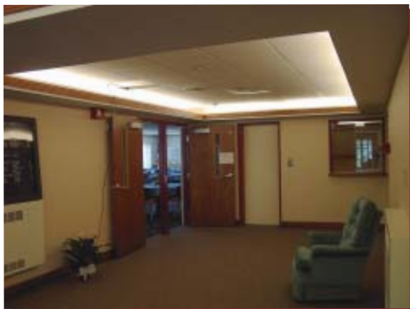
View looking at the new lobby and entrance to the Dining room from the new front entrance.