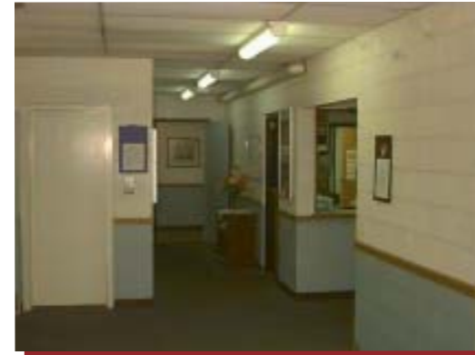
View looking at the Old Office and Lobby area before renovation.