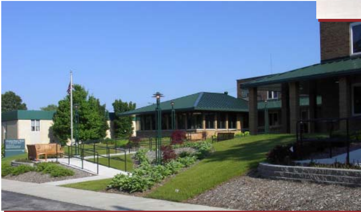
NEW PHOTO MAIN ENTRANCE AFTER RENOVATION

The goal of this renovation was to give the residents a place near the front entrance to socialize and have a pleasant place to wait for visitor's. The existing main entrance had several steps making the way virtually unusable. The new entrance and walkway is barrier free as well as resident friendly. Benches are conveniently placed along the way at thirty foot intervals. Winter weather is easily taken care of with the snowmelt system in the walkway. The residents and office staff now have working and socially comfortable areas with the new offices, entrance and lobby.