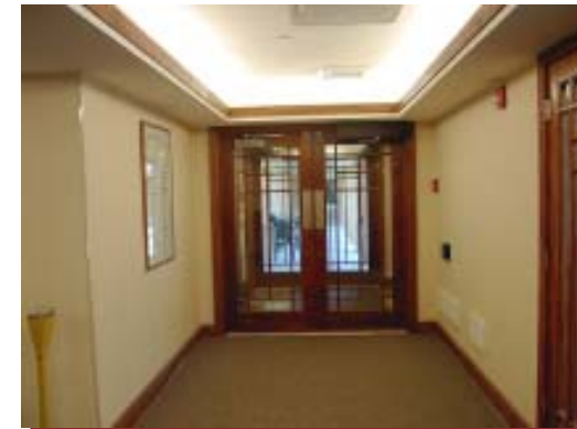
View looking at the new Main entrance.