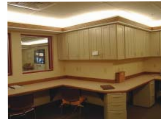
New Office area looking out to the lobby