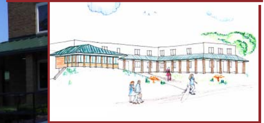
PERSPECTIVE VIEW OF PROPOSED RENOVATION

The existing office area was nine feet by fifteen feet plus a disconnected private office. The goal here was to unify the space and increase the area to approximately thirty four feet by twenty six feet. This area is staffed by the administrator, assistant, secretary and other volunteer staff. See the following page for the final result.