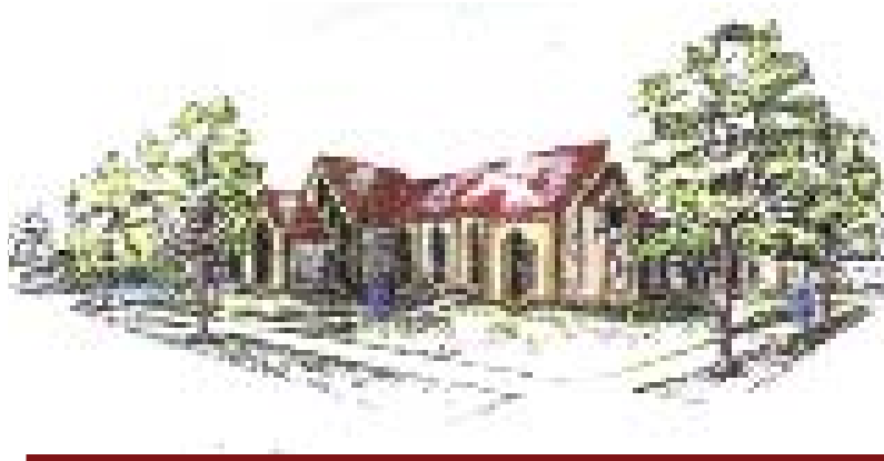
Concept for a Church Remodeling & Addition

UN-BUILT DESIGN 1974-2003 USA VARIOUS LOCATIONS