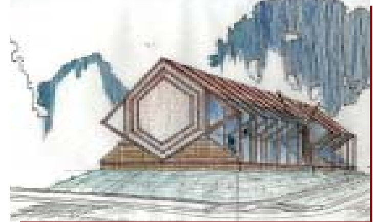
Concept for a an Office Building remodeling