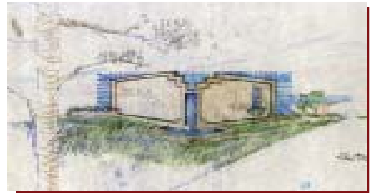
Preliminary Design for a Restaurant, Bloomfield Hills, MI